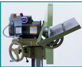
35° Up Tilt