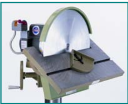
45° Down Tilt