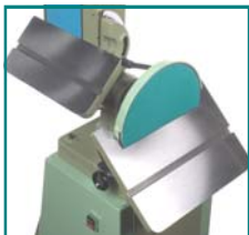
45° Down Tilt