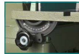
Angle gauges for table tilt reference.