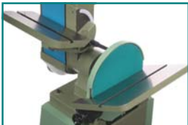
20° Up Tilt