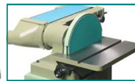
Infinitely adjustable belt sander positioning from vertical to horizontal.